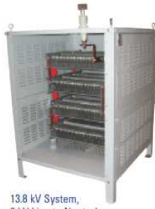
13.8 kV System, 8 kV Line to Neutral, 400 Ampere, 10 Second