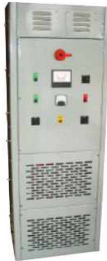
High Resistance Grounding System