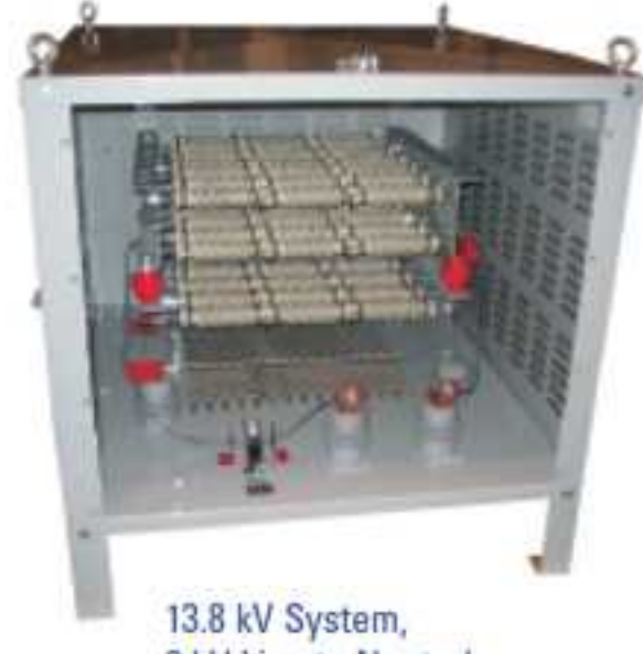
13.8 kV System, 8 kV Line to Neutral, 50 Ampere, 10 Second

The neutral grounding system's purpose is to protect life and property in the event of 50/60 Hz faults (short-circuit) and transient phenomena. Neutral Grounding Resistors are designed and tested in strict accordance with IEEE Standard 32-1972.