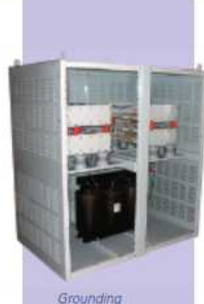
Grounding Transformer Cubicle