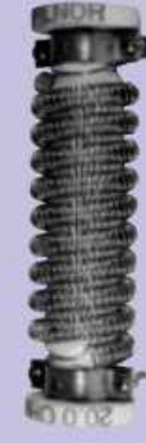
Helicoil Wire Wound Resistor used for low current applications.