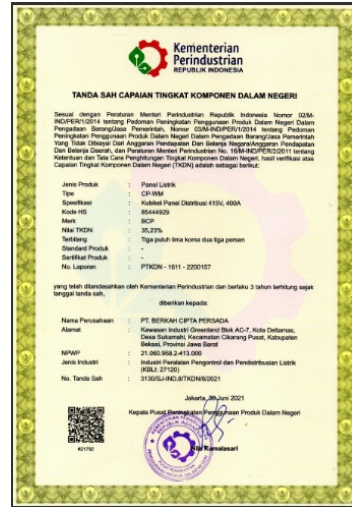
Local Content Certificate By Ministry of Industry